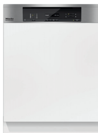
PG 8130i Item 61813052USA - (120V) Item 61813051USA - (208/240 V)